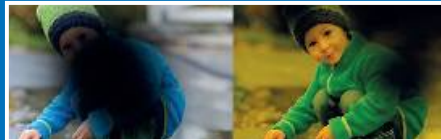
Typical symptom of Macular Degeneration